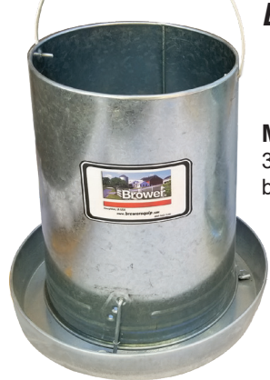
Model GLV30H 30 lb. capacity for birds of all ages.

Bright Spangle, Premium Steel • Competitive Pricing